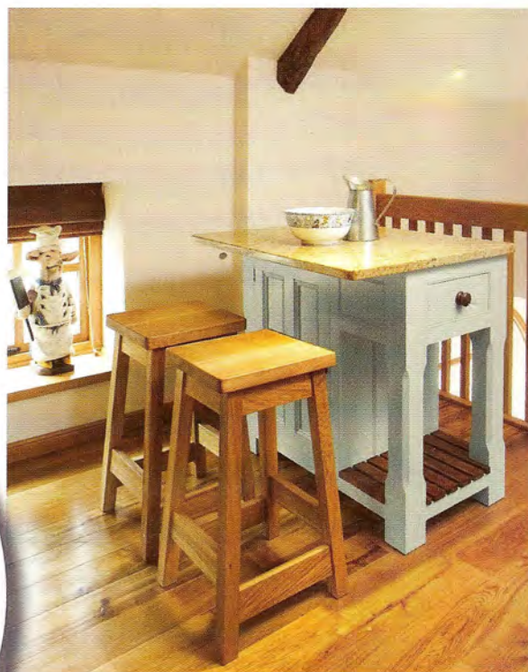
▲ Designed mainly as a place for Bob to sit at meal times, Carolyn has created a granite-topped breakfast bar similar in style to a traditional butcher's block. For similar wooden stools try John Lewis